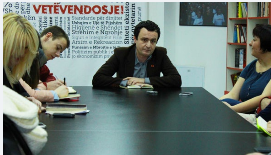
Meeting with Albin Kurti

Kurti added that the Belgrade-Prishtina dialogue should be continued, but it must not be the only step towards solving the issue. According to